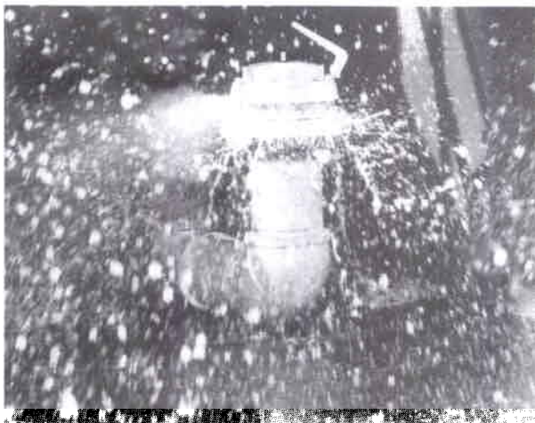
Pressure Relief Device Actuating Without Shield Installed

The Series SLD-603 Shield is not designed to be used with the standard QualiTROL side-mounted alarm switch. An externally mounted switch is available as an option, and provides easy test and reset capability from outside the Shield. The standard external switch is supplied with 120 inches of flying leads and a .50-14 NPS opening.